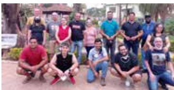
New Board Members

In November, our new Board of Directors started their two year term. We have a new president and treasurer on the board along with several other new members. Please be praying for the board during this time of transition and adaptation to their new roles.