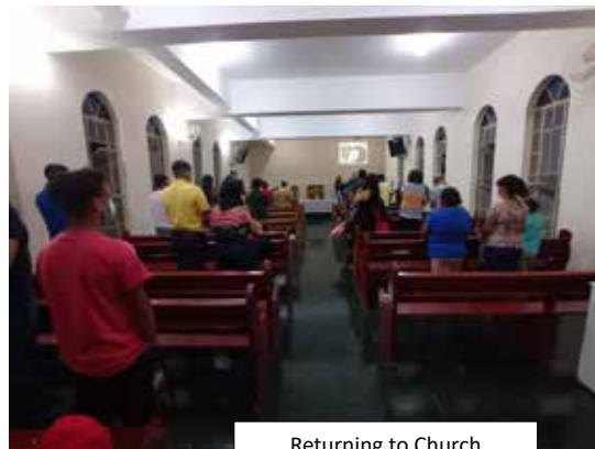
Returning to Church

We are grateful for your faithful prayers on behalf of this ministry, our children, staff, and us as directors. We also praise God for your generous and faithful financial