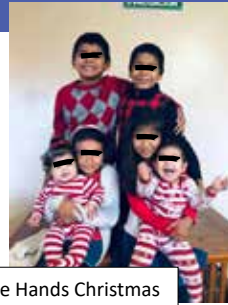
Little Hands Christmas