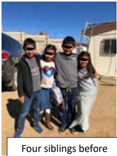
Four siblings before one is moved out