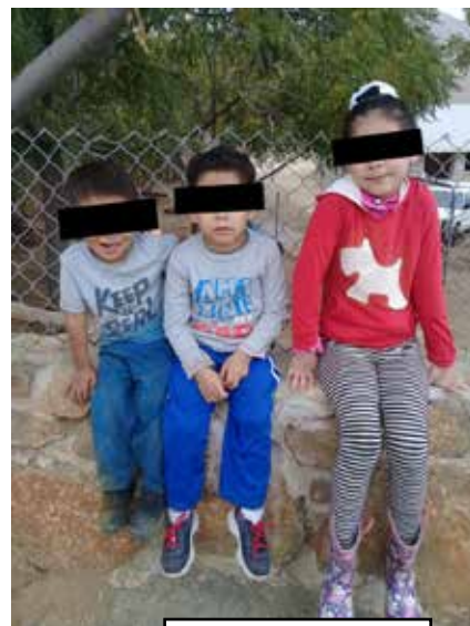
3 New kids

We celebrated one of the children's birthdays this past month! We pray for a year full of rich blessings upon this child.