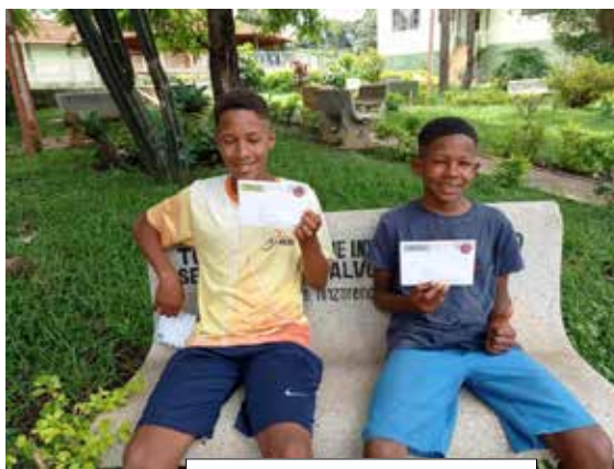
Christmas Cards from last year