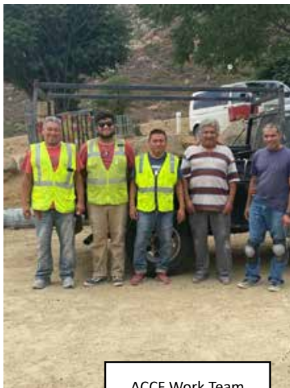
ACCF Work Team

We also had a few American citizens come to visit us this past month! They kindly blessed us with diapers and baby clothes, and they expressed their desire to continue to support the orphanage in such ways. We are grateful to see how mysteriously, yet purposefully, our God watches over us and gives us all that we need!