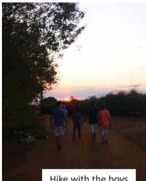
Hike with the boys

The holiday season is fast approaching and Christmas will be here soon. With that in mind, we would like to encourage you to send Christmas cards to our boys. They so look forward to this tradition every year, and it is a special gift just for them.