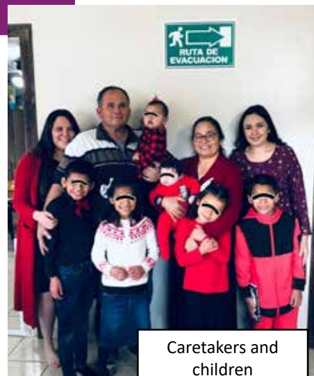
Caretakers and children