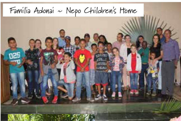
Familia Adonai ~ Nepo Children's Home

of behavior. Please pray for his continued adaptation and that he will come to know and accept the Father's love for him.