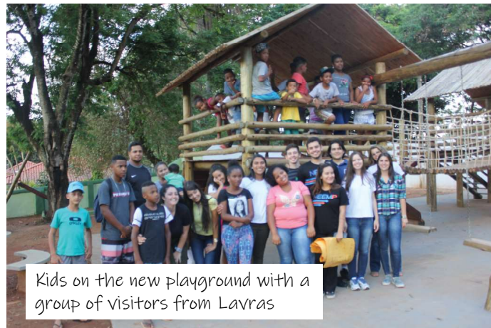
Kids on the new playground with a group of visitors from Lavras

the old laundry room into small living spaces for our new