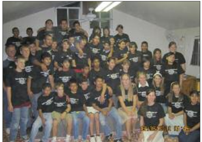
Tecate Vacation Bible School

Sunday evening we prayed together and visited some young people and adults who were very happy for the visit. Monday at