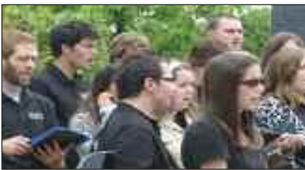
Outdoor Concert - Neuhutten, Germany

Our first official performance was in Lindenwiese, Germany, and I remember the congregation's excitement in hearing the message of Christ through song., it was evident in the smiles that radiated from their faces. The joy and passion over the message of our songs seemed to permeate in all the congregations. Another highlight for me was simply being able to fellowship with many different people. We were so blessed to be able to spend time getting to know our hosts- both young and old and it was so