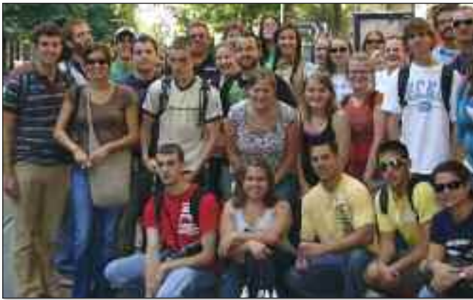
1st day in Zurich

bus I wanted to drop to my knees in worship. If something God created is that beautiful, how GORGEOUS must God himself be!!??? It made my soul long for eternity-to be with Him, the one who is Ultimate Beauty. Everything else slipped away as I tried to take it all in, and somehow God used those moments to calm my soul, draw me closer to Him, and renew me. The song we sang "How Great is Our God" became real and alive for me after those experiences on the mountains.