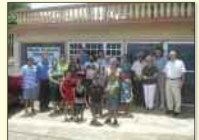
Part of our Sunday morning group in front of the church.