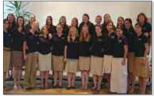
The Ladies - Bachenbulach, Switzerland

There are two moments from Youth Choir I will never forget. We were up in the mountains for both-near Salzburg and in the Emmental on our way to Langnau, Switzerland. They were the most incredible moments of the entire tour! Seeing the glory and majesty of God's creation was awe-inspiring! When I got off the