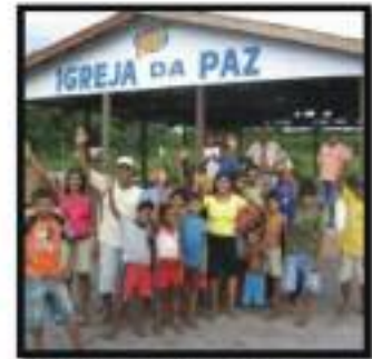
New bases and strong Brazilian leaders fuel the growth of cell groups and new churches.

Recently in Santarém, the church had over 50,000 people attending their cell groups in one week. In 35 short years, God has turned this city around and is using it as a staging point for winning the Amazon for Christ. Santarém offers a glimpse of what the other bases will look like 20 to 30 years from now. The road isn't easy — the cost is prayer and fasting, work and dedication, giving and sacrifice, but the results, as individuals give their hearts and lives to Christ, is worth it all.