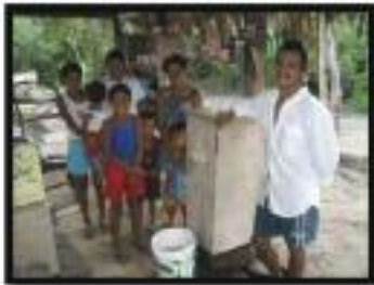
River families stay healthy with filters delivered by PAZ boats.

We not only work to equip the PAZ team with the spiritual tools that they need to spread the Gospel and build strong churches, but we work to provide for the physical tools that are required to pastor and disciple Christians in the river and jungle villages.